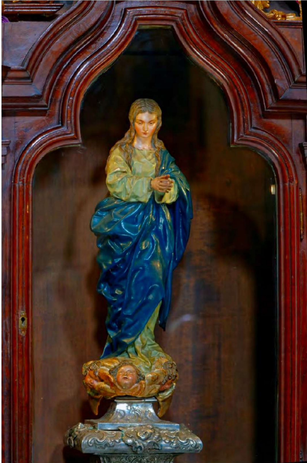
Fig. 3. Alonso Cano, Immaculate Conception , Granada Cathedral, 1655-56