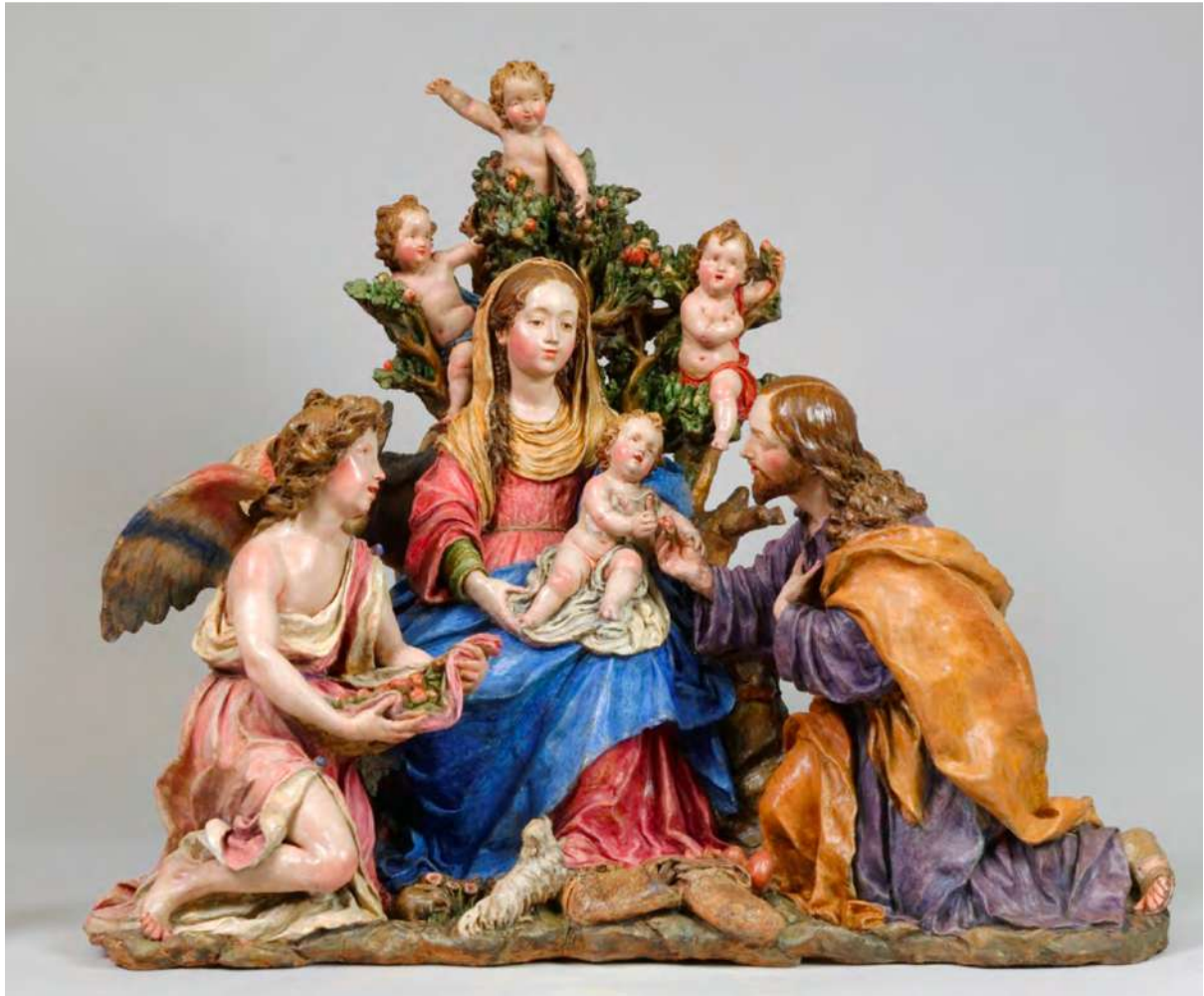
Fig. 6. Luisa Roldán, Rest on the Flight into Egypt , The Hispanic Society of America, 1690-1706