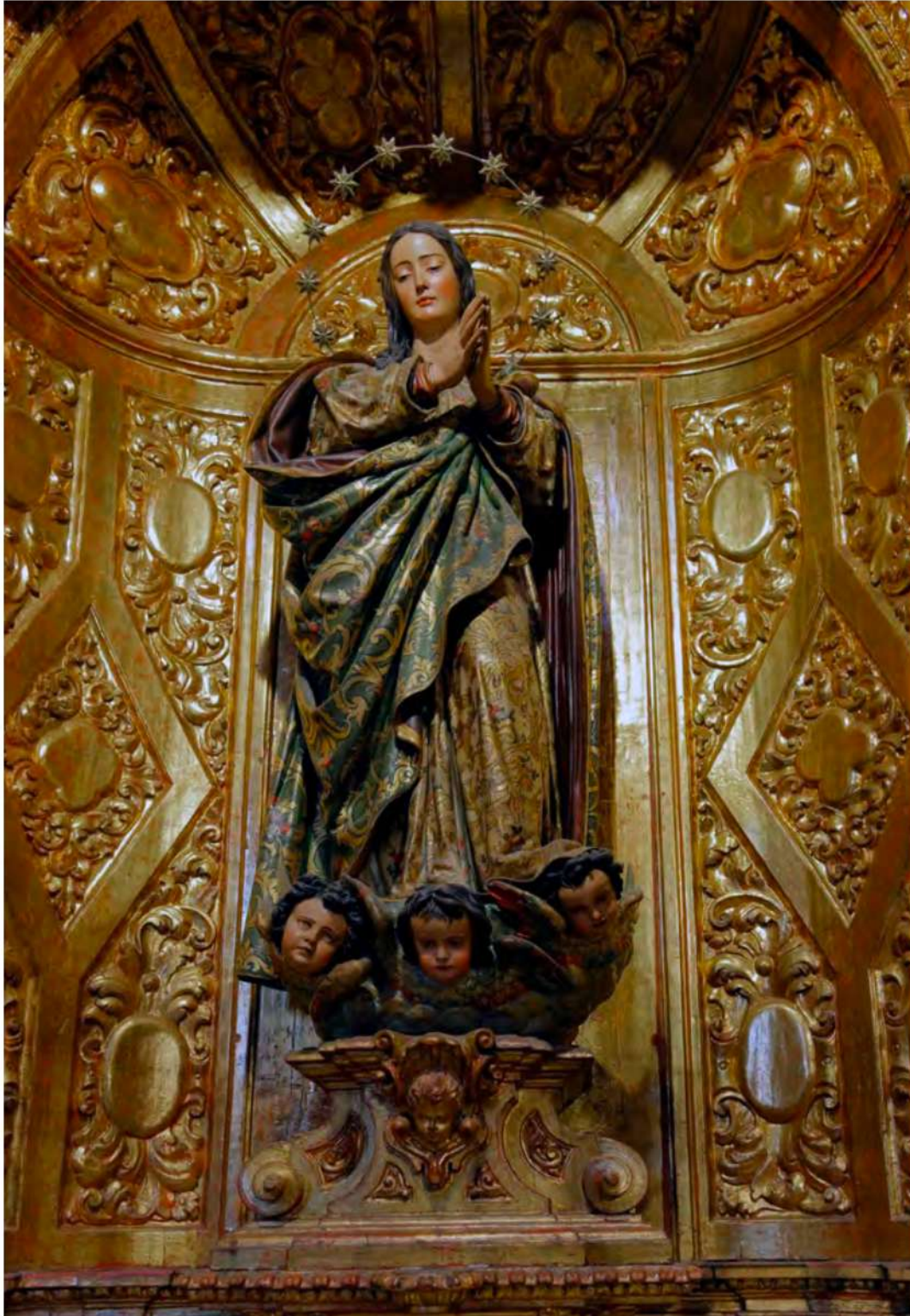
Fig. 2. Juan Martínez Montañés, Immaculate Conception , Seville Cathedral, 1629-31