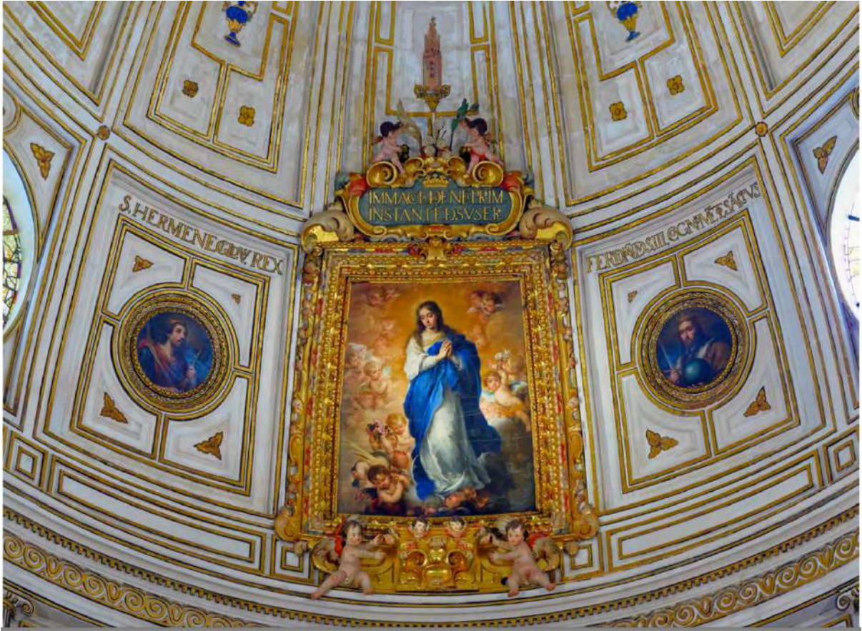
Fig 7. Bartolomé Esteban Murillo, Seville Cathedral Chapter Room, 1662