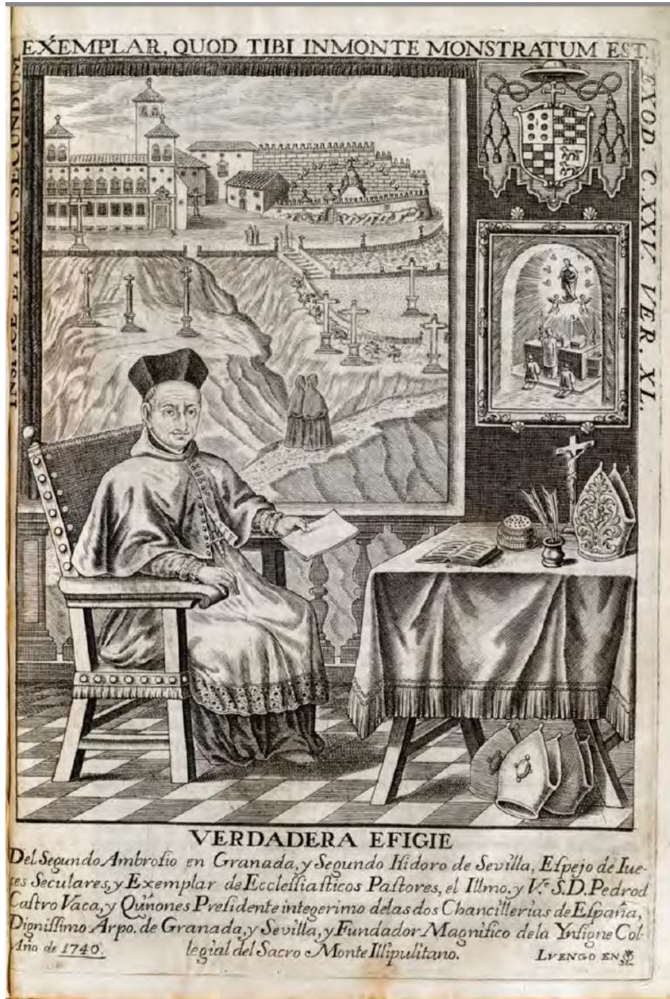
Fig. 8. Engraving of Pedro Castro Vaca y Quiñones with image of Virgin of immaculate Conception From: Heredia Barnuevo, Diego Nicolás de. 1741. Mystico ramillete histórico, cronológico panegirico . Granada: Imprenta Real