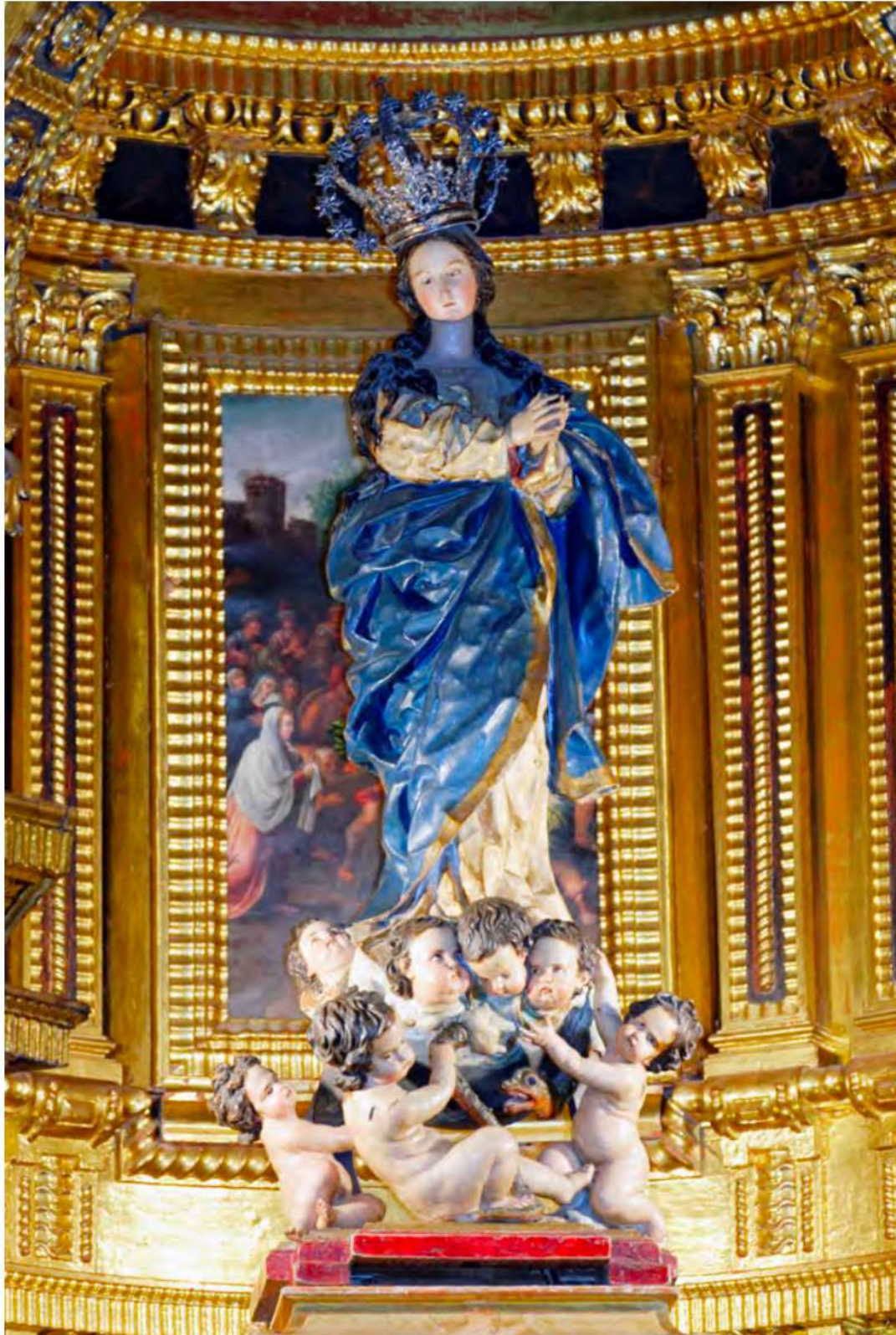
Fig. 5. José de Mora, Immaculate Conception , Santos Justo y Pastor, Granada, 1671-74